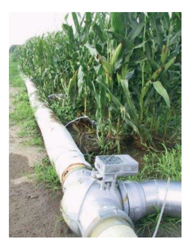
Figure 3. Two automatic surge flow valves manufactured in the United States.