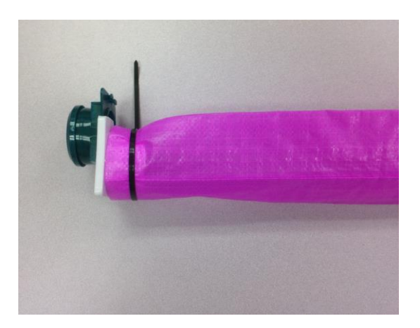
Polypipe insertion gate shown with sleeve to reduce erosion at the head of the furrow.

Figure 4. Recommended insertion gates and sleeve when using polypipe for furrow irrigation.