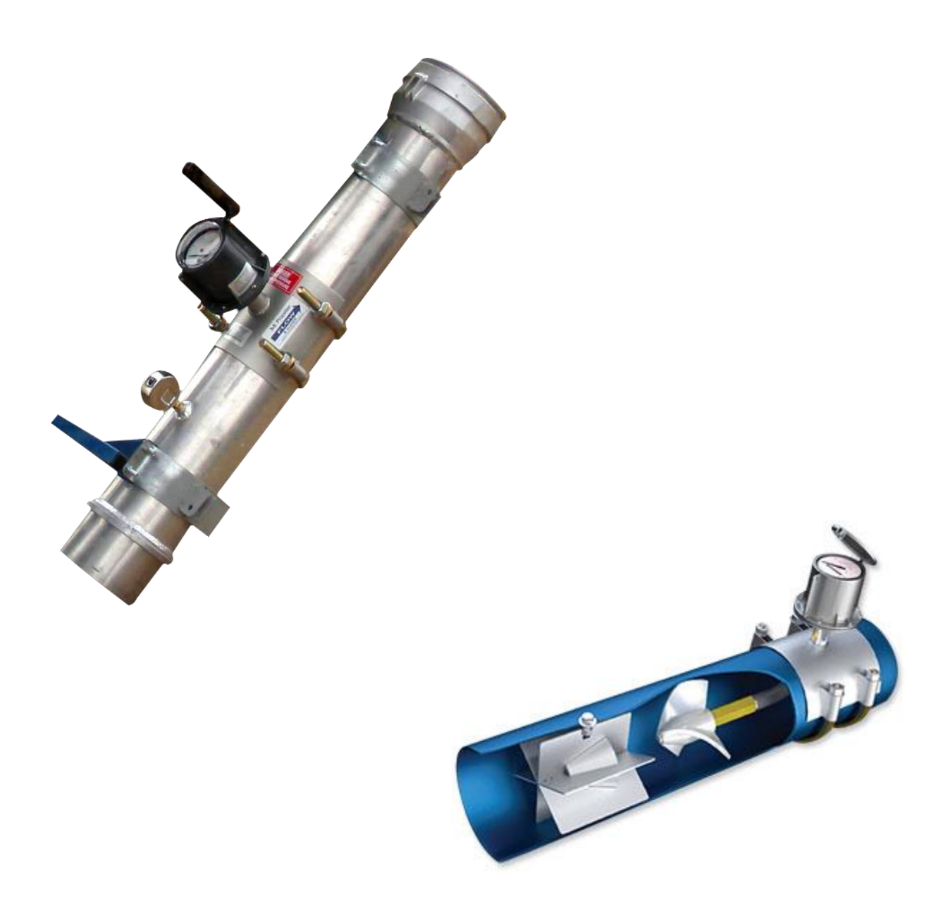
Figure 5. Portable flow test meter with a quick connector for easy insertion into existing pipelines or alfalfa valves.

These potable test meters can be ordered with handles, straightening veins to improve accuracy, and a pressure gauge. Usually, a smaller pipe-size than the existing pipeline is used to ensure a <u>full</u> pipe in the test meter.