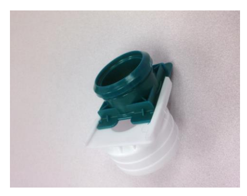
Plastic adjustable gate used with polypipe.

Surge is used with either gated aluminum pipe or polypipe. If using polypipe, it is important that the holes be punched precisely to achieve the targeted furrow stream size (gpm per furrow). Polypipe manufacturers have on-line guides and special hole punchers that will allow you to do this. Another alternative when using polypipe are insertion gates which pop into the punch holes which can be adjusted like aluminum gated pipe.