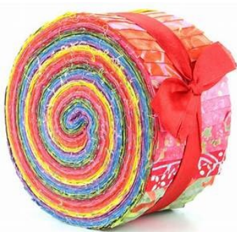
Jelly Roll of Fabric