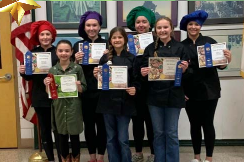
Brush Country 4-H Club Members at the District 12 Food Show & Food Challenge