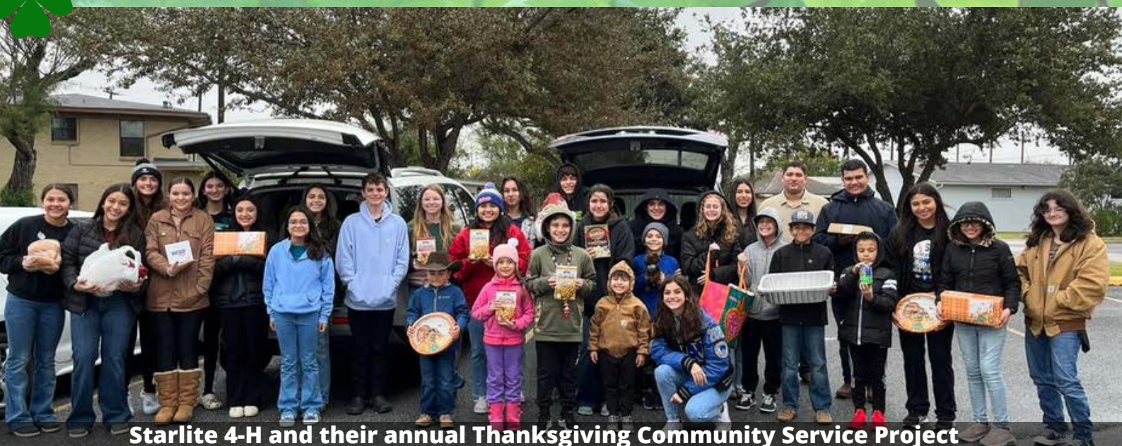
Starlite 4-H and their annual Thanksgiving Community Service Project