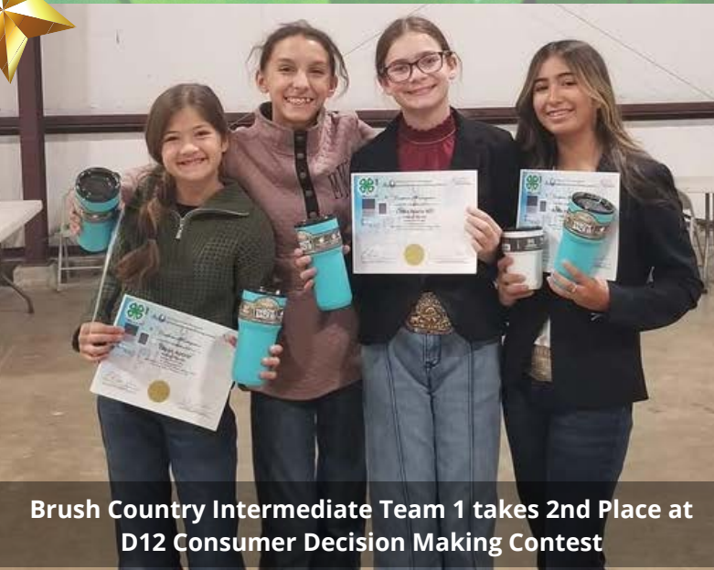
Brush Country Intermediate Team 1 takes 2nd Place at D12 Consumer Decision Making Contest