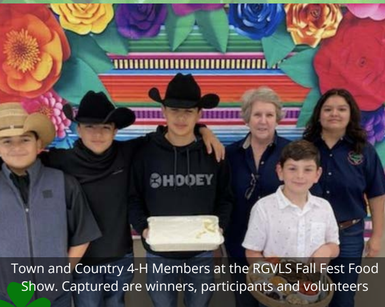
Town and Country 4-H Members at the RGVLs Fall Fest Food Show. Captured are winners, participants and volunteers