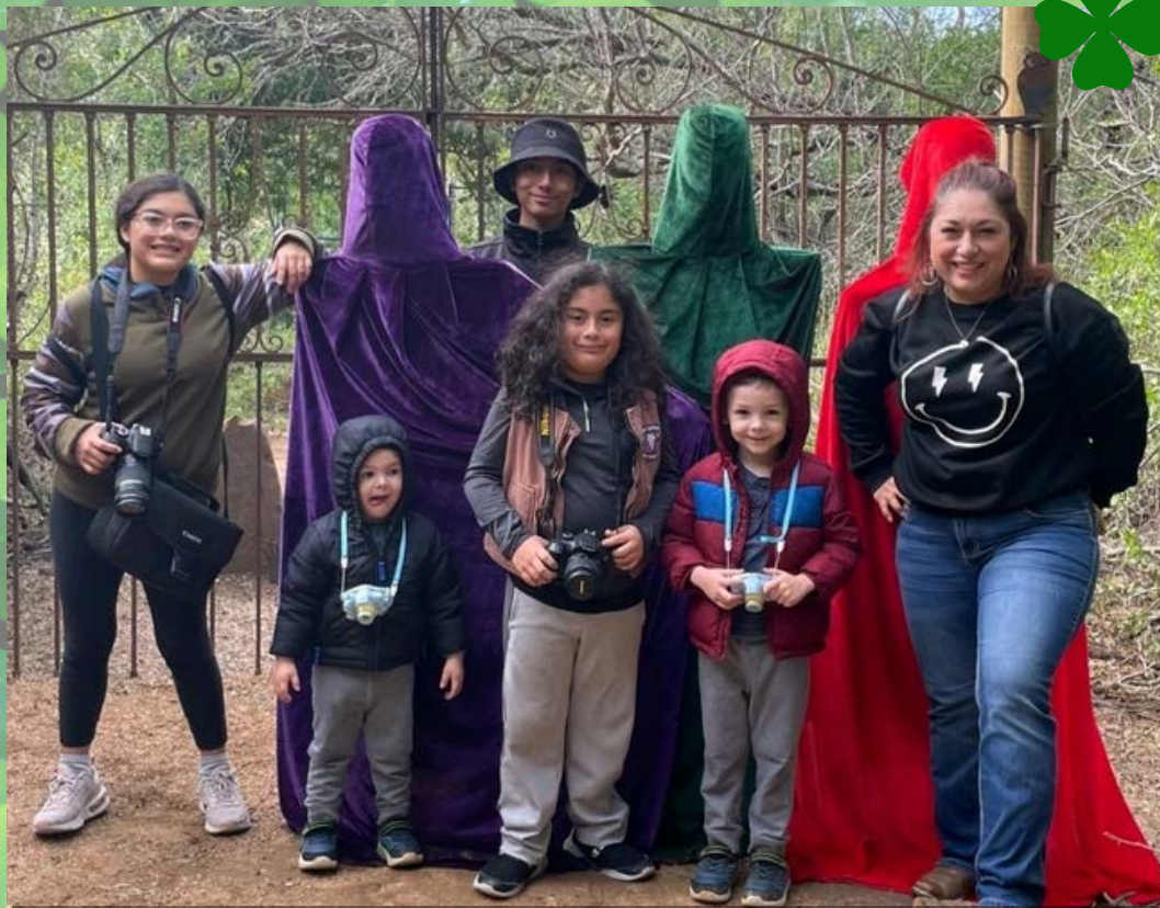
South Texas Attitude 4-H Club Members and Club Manager during a photography workshop at Quinta Mazatlan