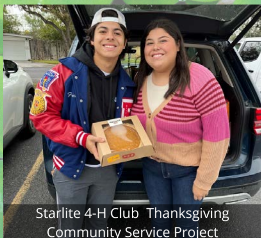
Starlite 4-H Club Thanksgiving Community Service Project