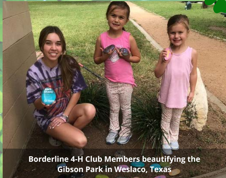
Borderline 4-H Club Members beautifying the Gibson Park in Weslaco, Texas