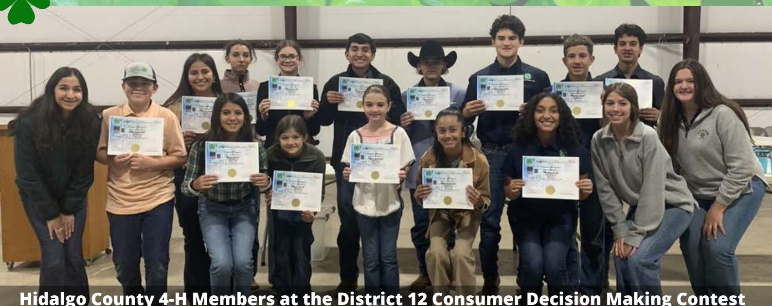
Hidalgo County 4-H Members at the District 12 Consumer Decision Making Contest