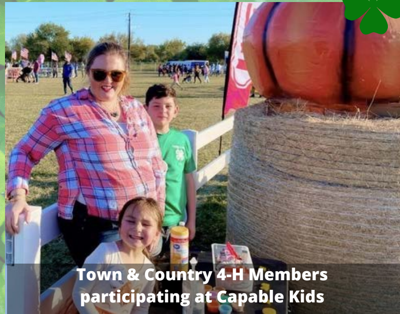
Town & Country 4-H Members participating at Capable Kids