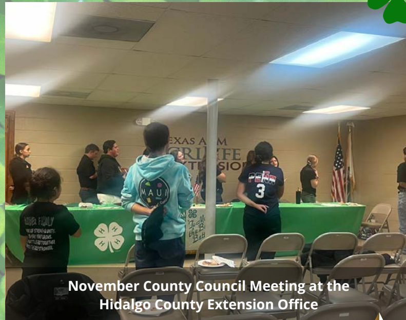
November County Council Meeting at the Hidalgo County Extension Office