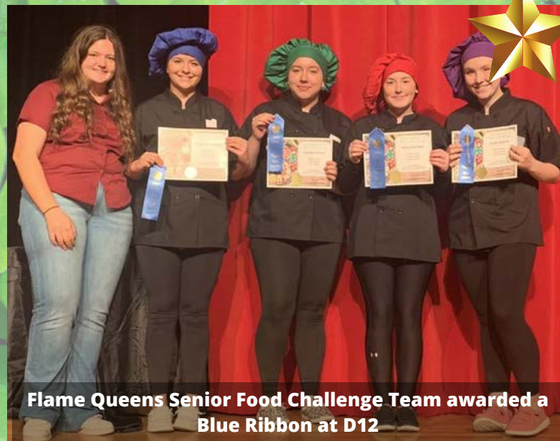
Flame Queens Senior Food Challenge Team awarded a Blue Ribbon at D12