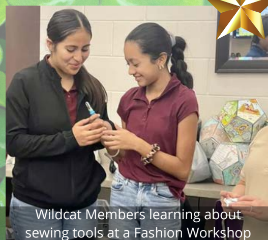
Wildcat Members learning about sewing tools at a Fashion Workshop