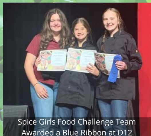
Spice Girls Food Challenge Team Awarded a Blue Ribbon at D12