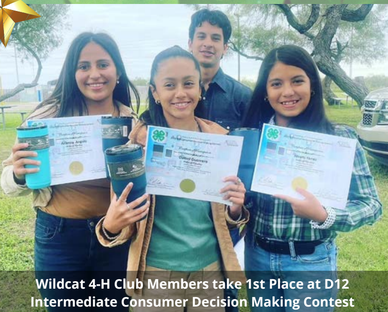
Wildcat 4-H Club Members take 1st Place at D12 Intermediate Consumer Decision Making Contest