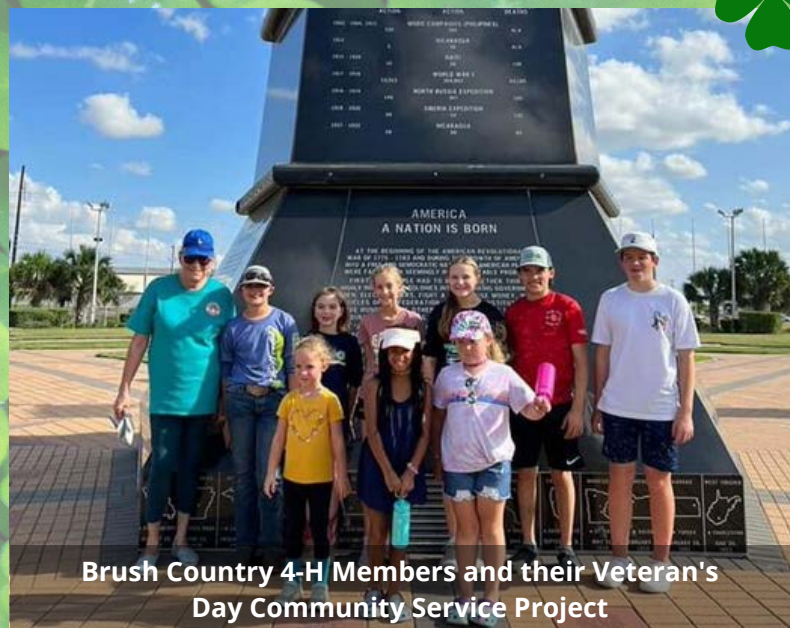
Brush Country 4-H Members and their Veteran's Day Community Service Project