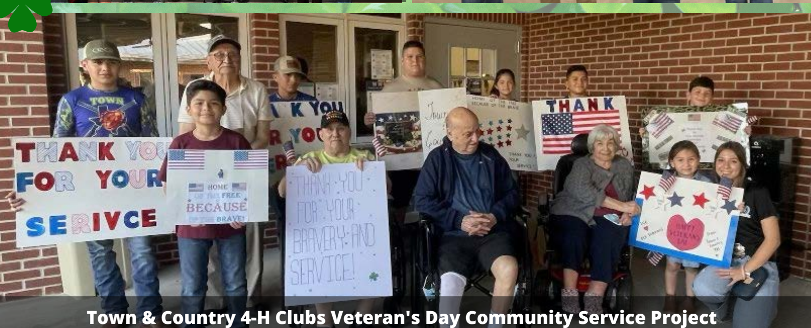
Town & Country 4-H Clubs Veteran's Day Community Service Project