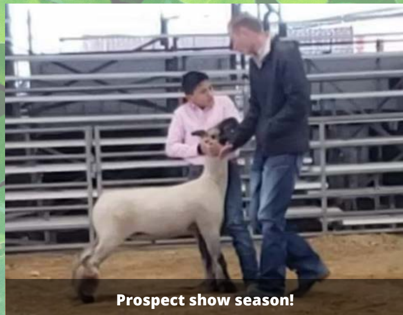
Prospect show season!