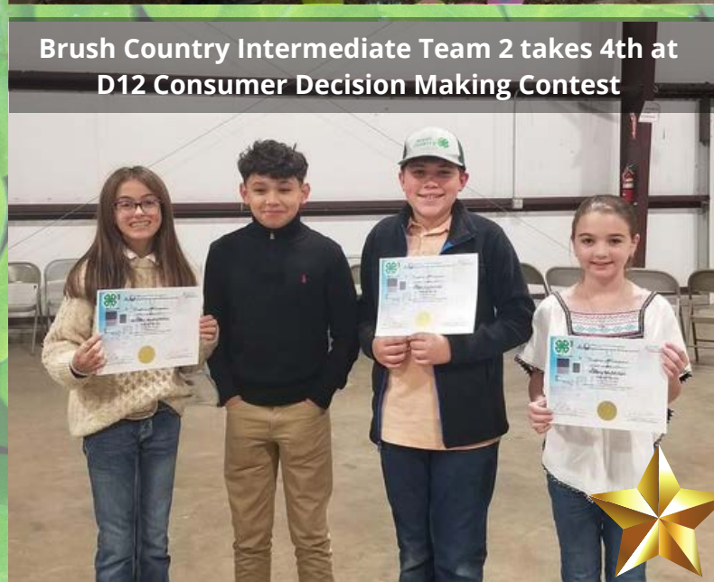
Brush Country Intermediate Team 2 takes 4th at D12 Consumer Decision Making Contest