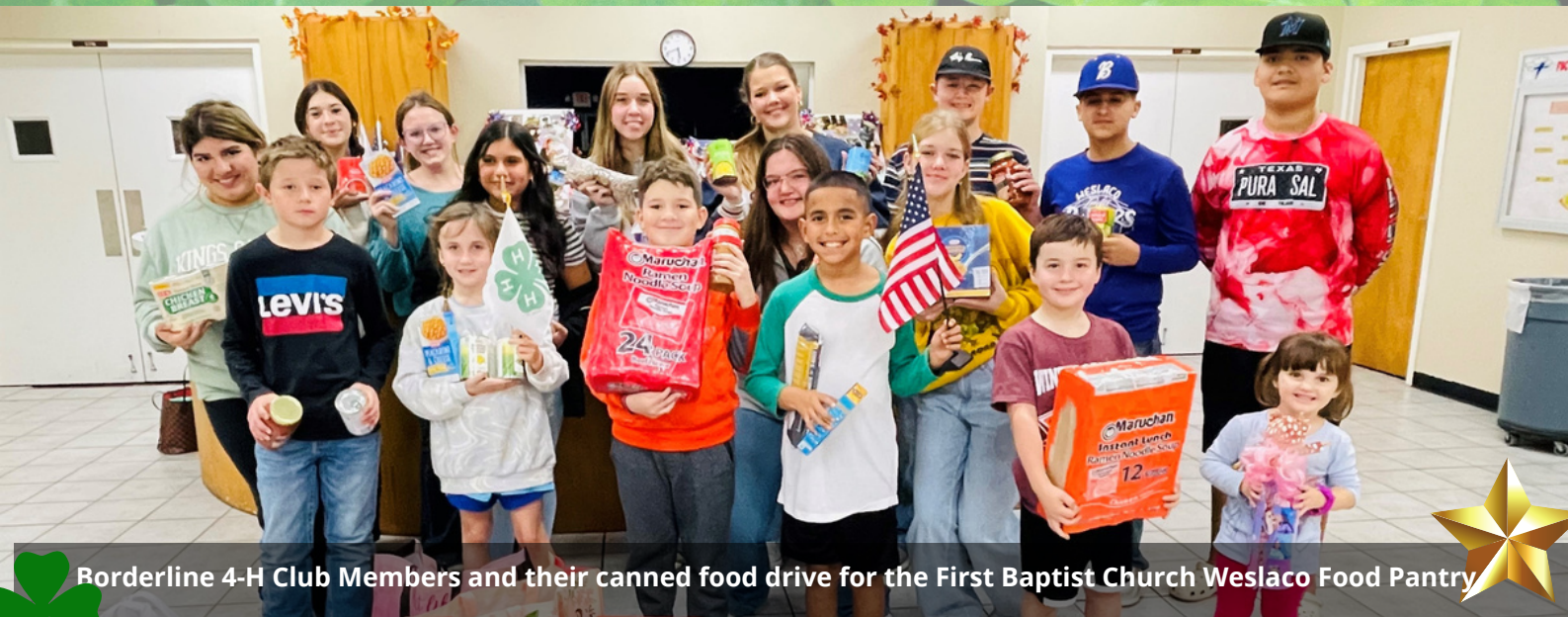
Borderline 4-H Club Members and their canned food drive for the First Baptist Church Weslaco Food Pantry