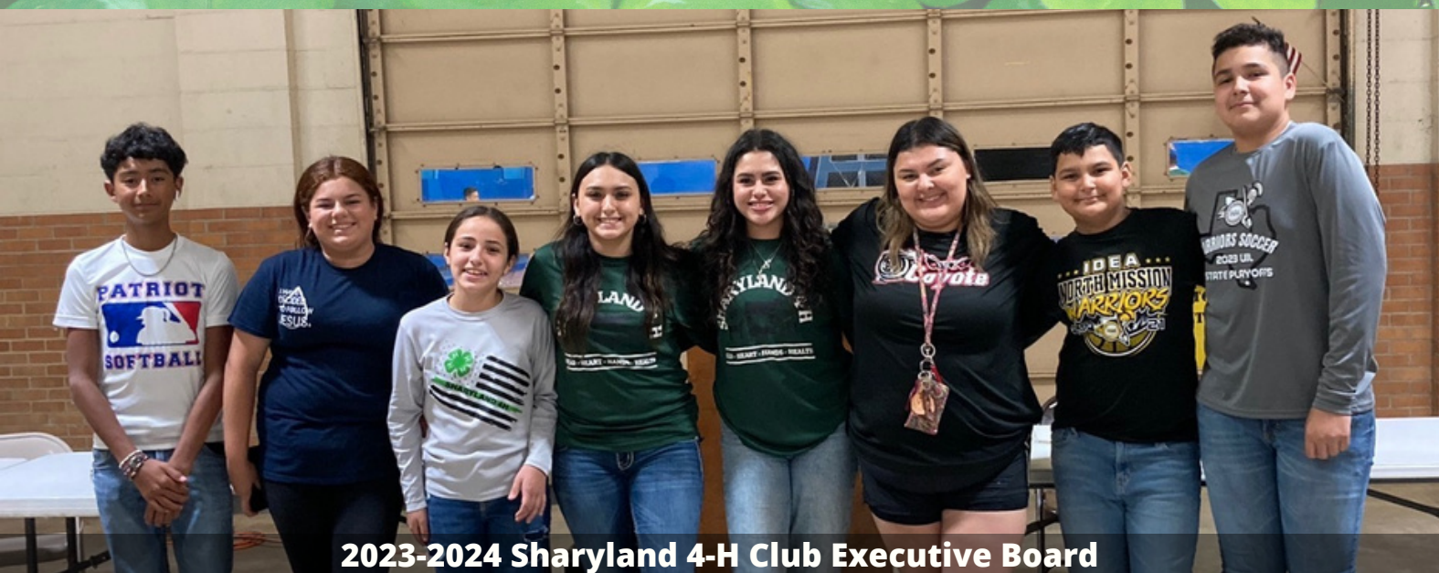
2023-2024 Sharyland 4-H Club Executive Board