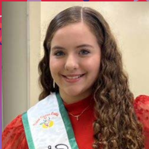
1st Vice President