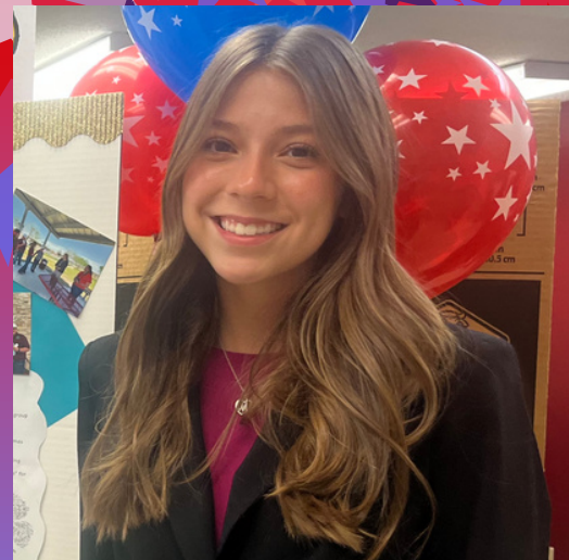
2nd Vice President