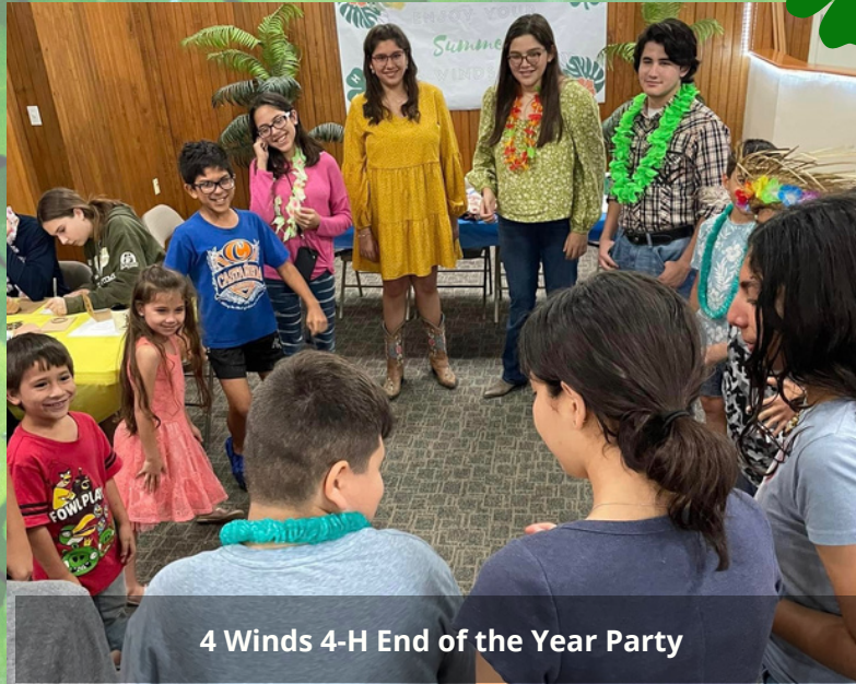
4 Winds 4-H End of the Year Party