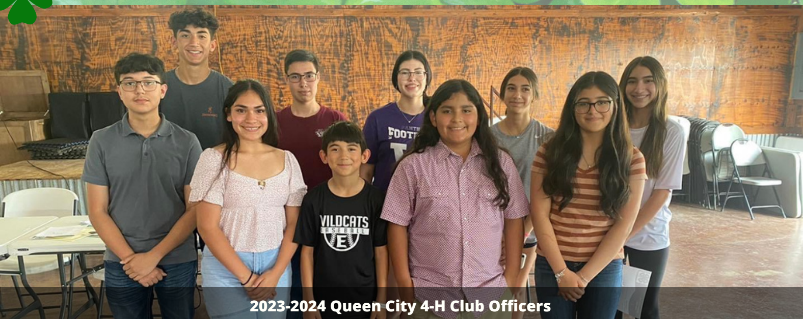
2023-2024 Queen City 4-H Club Officers