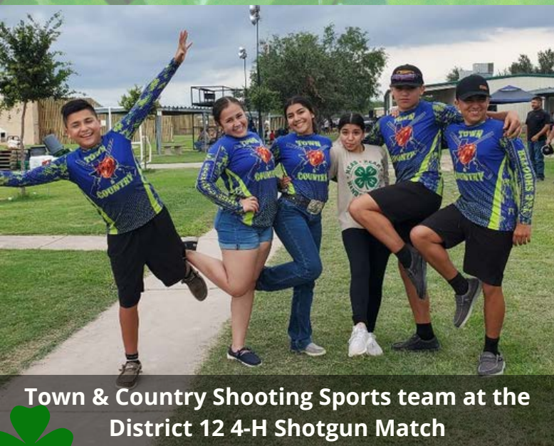
Town & Country Shooting Sports team at the District 12 4-H Shotgun Match