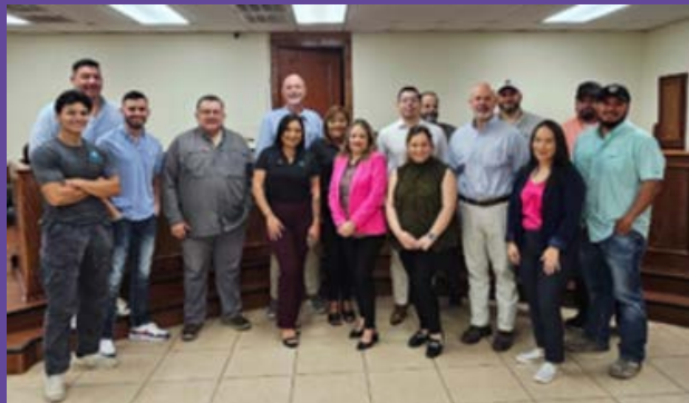
Homebuilders Workshop: Navigating USDA Home Programs in Elsa TX.